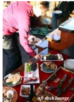
aft deck lounge