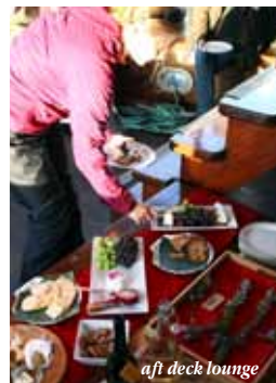
aft deck lounge