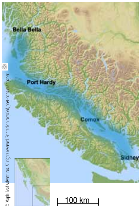
© Maple Leaf Adventures. All rights reserved. Printed on recycled, post-consumer paper

To cruise the east coast of Vancouver Island and into the Great Bear Rainforest on the Maple Leaf is to take an odyssey through both time and nature.