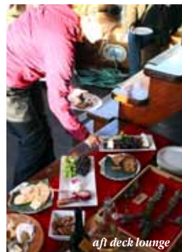
aft deck lounge