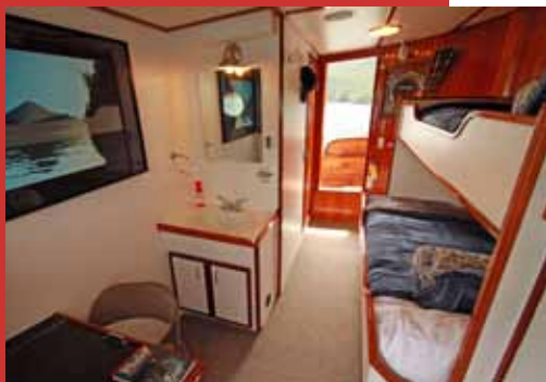
a) Angled Boat Double