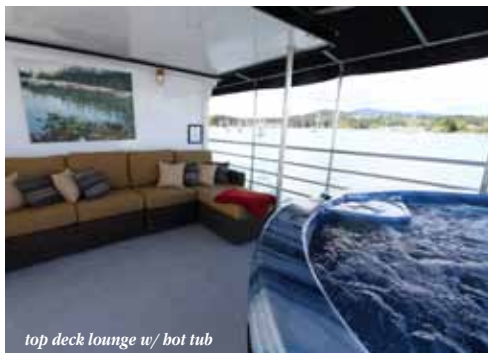
top deck lounge w/ hot tub